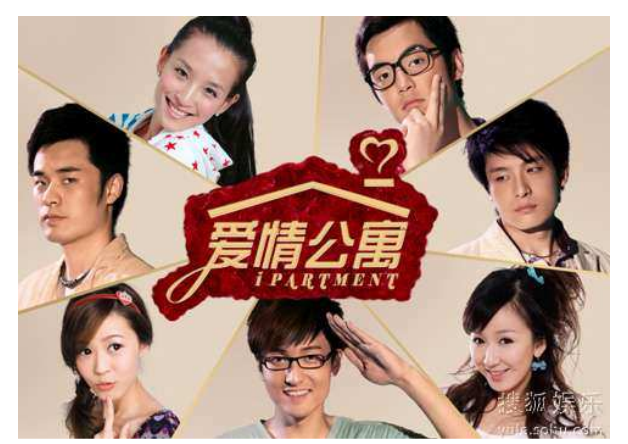
Figure 4. An image of characters from i Apartment .